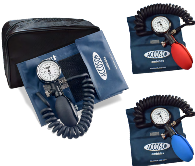
Code Product Description 0322A Duplex with Adult Ambidex Cuff 0322AB Blue Duplex with Adult Ambidex Cuff 0322AB Red Duplex with Adult Ambidex Cuff