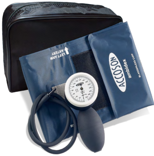
Code Product Description 0292A Limpet with Adult Ambidex Cuff