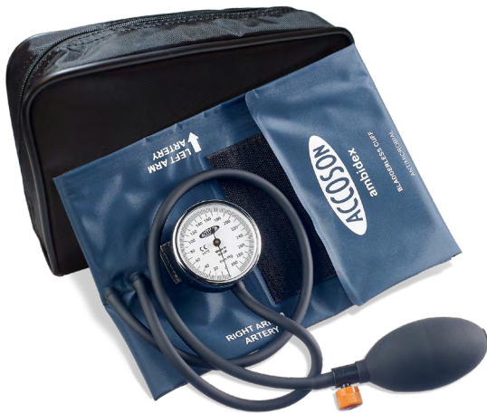
Code Product Description 0312A Pocket with Adult Ambidex Cuff